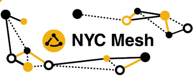
A community-owned network to connect your home or business

Web: www.nycmesh.net Facebook: NYC Mesh Twitter: @nycmesh Instagram: @nycmesh Medium: NYC Mesh Slack: nycmesh.slack.com